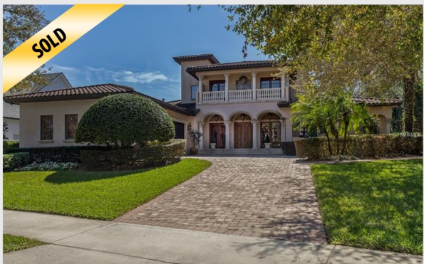
1642 Lookout Landing Cir $1,550,000 Winter Park listing under contract in only 2 weeks!