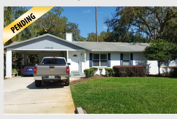
14419 Pinecone Rd, Orlando 32832 Isle of Pines. $249,900