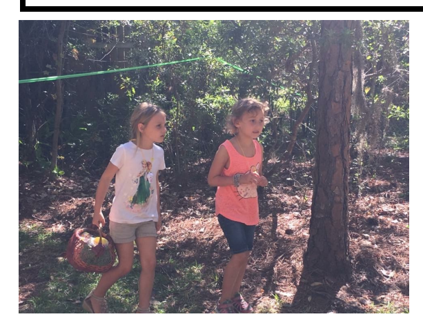
Hope everyone had a good time at our Easter Egg Hunt!!

Remember if you have an up coming Birthday, Anniversary or other special event you would like in the newsletter, please email iopnewsletter@yahoo.com! Please submit by the second Saturday in the preceding month.