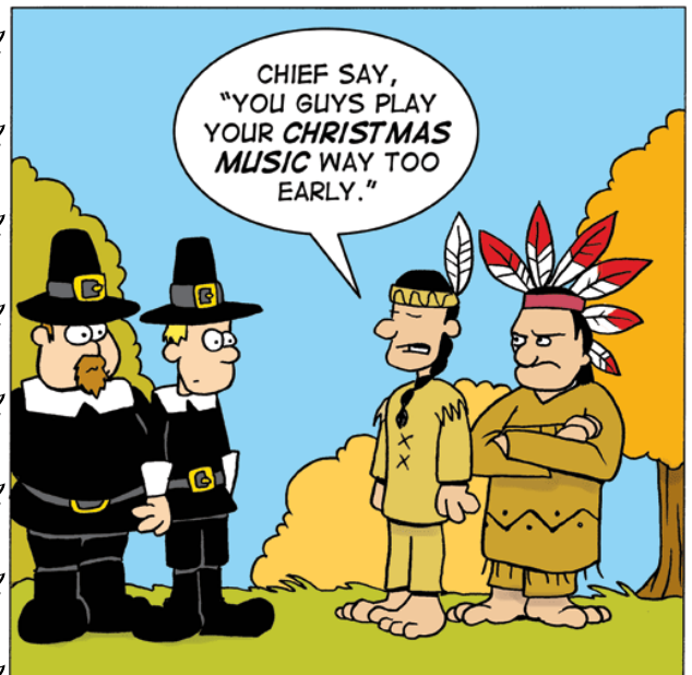
SPUDCOMICS.COM © 2011 LONNIE EASTERLING BEFORE THE FIRST THANKSGIVING