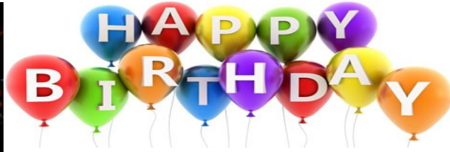
Knighten Kraznik July 27