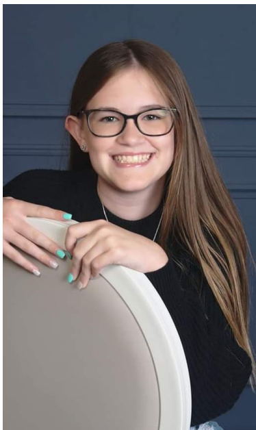
Happy 15th B.B. - July 28th