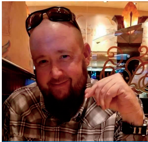
Happy 49th Birthday Ole Man!