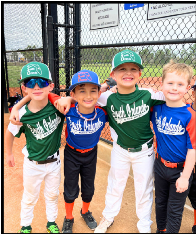
South Orlando Babe Ruth Boys of IOP